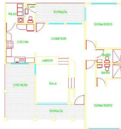
PLANTA DE DISTRIBUCION