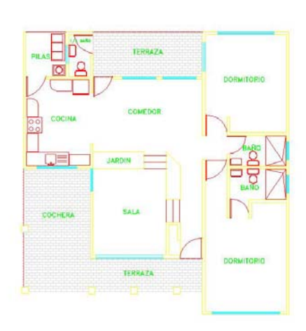
PLANTA DE DISTRIBUCION